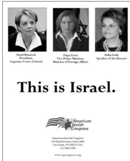
The advertisement that Ms. magazine refused to print—which then ran in The Nation.

The controversy erupted in the press, as hundreds of newspapers, magazines and blogs reported on the ad and debated the story, and leading Jewish feminists gathered in New York for a press conference demanding that Ms. reverse its decision. The AJCongress website alone received thousands of letters of support. In an interesting turn of events, in March, The Nation , America's oldest